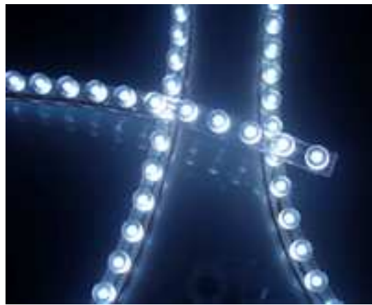
FlexLED IP65 True White

FlexLED IP65 is a versatile encapsulated White LED strip. The LED's are sealed into a flexible plastic strip to keep out water ingress. Available in warm white or true white. This product is very low power (7.2 W per strip) and can be used with our range of power supply units.